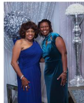
State and District Presidents