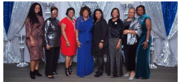
Friends from District I, Tupelo