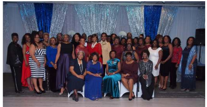
District IV Members